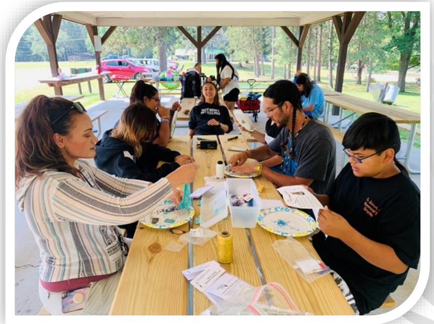
Beading at the Park

Building a strong community and cultural identity