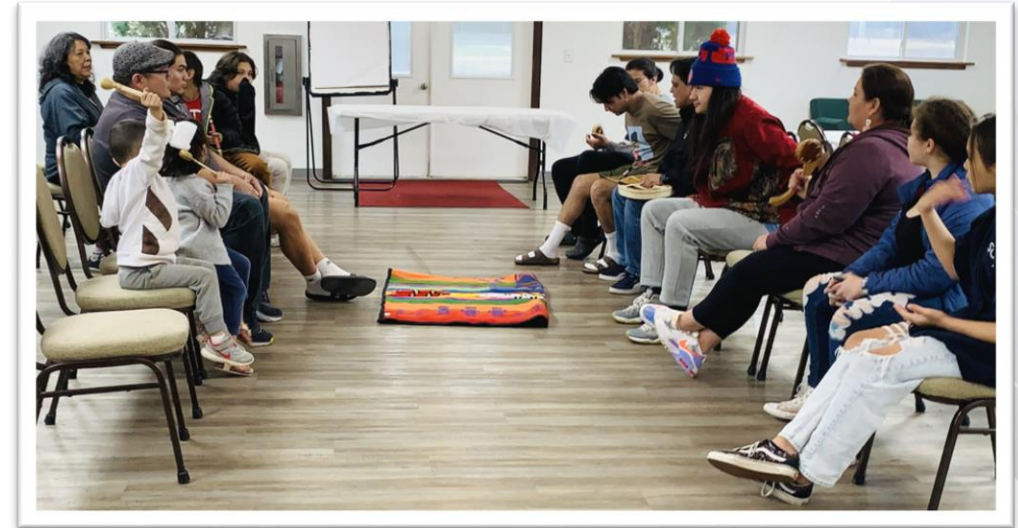
Traditional Game Night