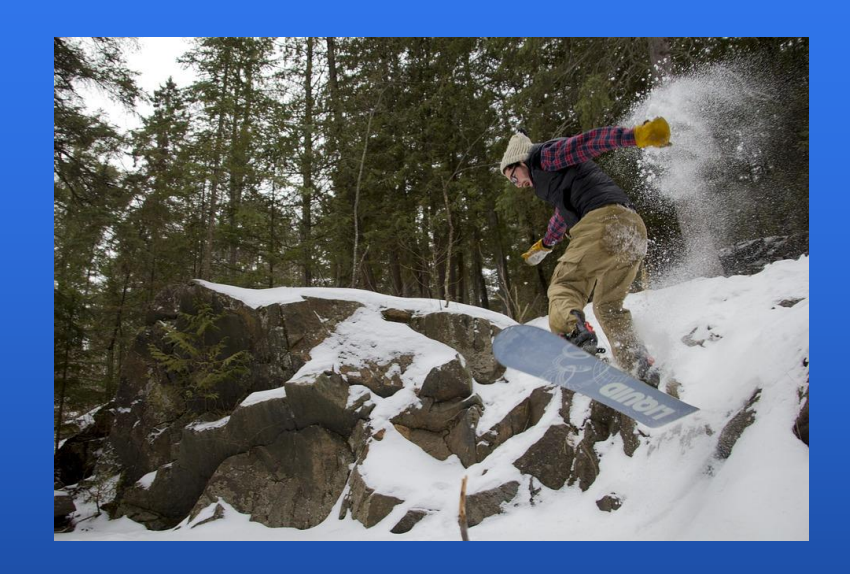
Consider our discussion in Session 1- Do you remember our "Fearless Youth" example?