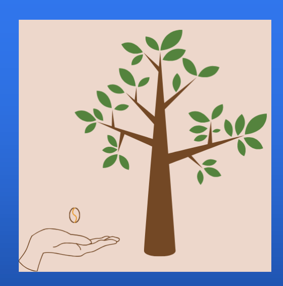
Administration of Incentives and Sanctions