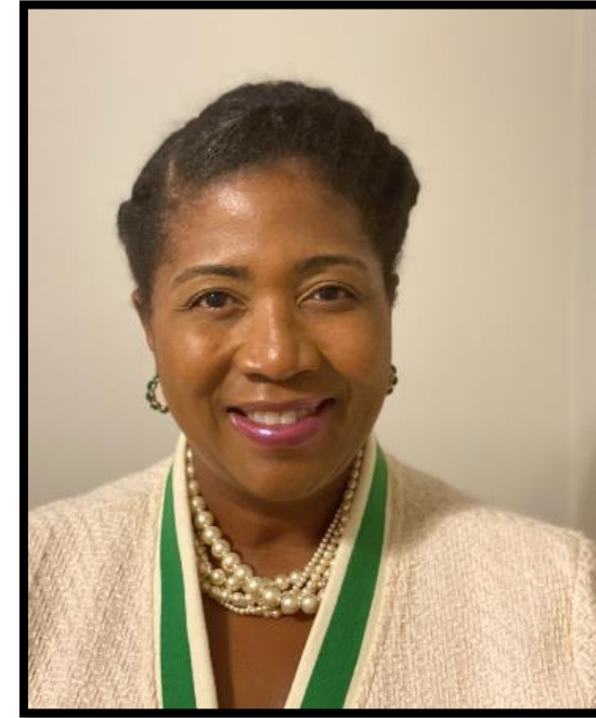
Geroma Void Office of Juvenile Justice and Delinquency Prevention