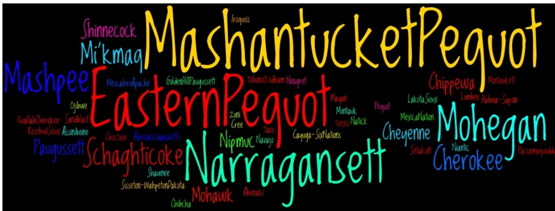
Tribal Community Members Who Have Taken Part in the MPTN Circles of Care Project