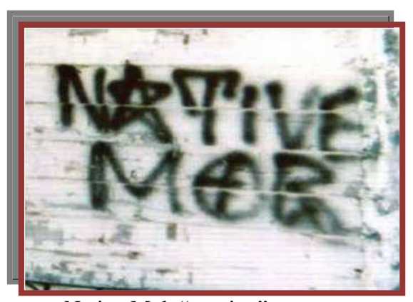
Native Mob "tagging"

In the early to mid-1990's, several Native American males began associating with the Vice Lords criminal street gang in south Minneapolis, Minnesota, primarily for the purpose of drug distribution. Eventually, due to various issues between Vice Lords members and their Native American counterparts, a split occurred between the two groups, resulting in the formation of the criminal street and prison gang known today as Native Mob, or Native Mob Family.