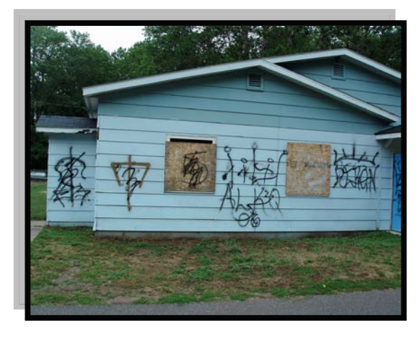
Lac Courte Oreilles Reservation, Wisconsin

However, there are also individuals who relocate to the tribal community for the purpose of engaging in gang recruitment, establishing drug distribution networks, or other nefarious motives. An example of this can be found in the transplanting of the Latin King gang influence from the Milwaukee area to the Lac Courte Oreilles Reservation in Wisconsin in the early 2000's.