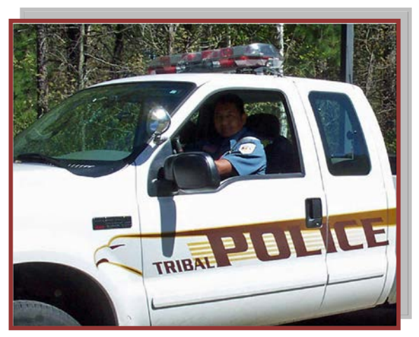
In a study conducted in 2001, the agency reported that the typical law

According to the U.S. Department of Justice, many tribal law enforcement agencies across Indian Country remain seriously understaffed due not only to budgeting issues, but also to the lack of qualified candidates, lack of available housing for law enforcement personnel and/or lack of adequate compensation compared to non-tribal agencies and other issues. The agency also reports that turnover among Indian Country law enforcement officers remains high, resulting in the constant need to recruit and train replacement officers, thereby affecting the ability to create an effective community policing atmosphere.