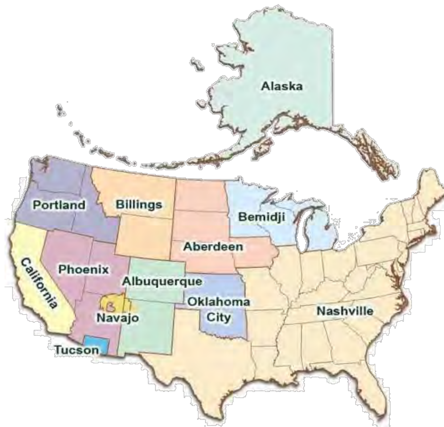
Figure 3. Map of IHS Areas

The IHS has a service population of approximately 2 million from 565 different Federally recognized Tribes and 34 urban Indian communities; about 1.5 million are considered IHS active users (i.e., persons who have received care in the most recent three-year period). The mission of the IHS is to raise the health status of the AI/AN people to the highest level possible. Efforts toward achieving this mission include the administration of direct healthcare services through a system of 12 Area Offices and 163 IHS and Tribally managed service units. A map of the IHS Areas is provided below. The pages that follow provide a profile of behavioral health services and resources in each Area, along with a program spotlight that details a featured behavioral health program.